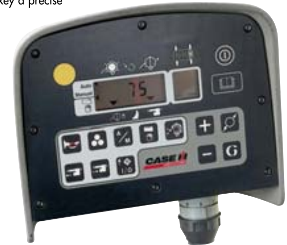
Fully automated bale formation and electronic bale control at the touch of a button.

Self-diagnostic system. Designed to instantly alert the operator should any malfunction occur in the system during the baling process.