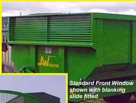
Standard Front Window shown with blanking slide fitted