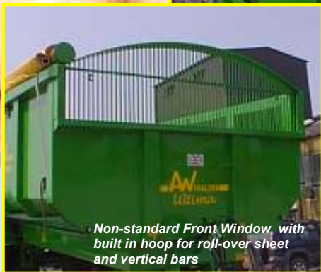
Non-standard Front Window, with built in hoop for roll-over sheet and vertical bars