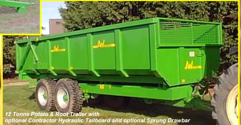
12 Tonne Potato & Root Trailer with optional Contractor Hydraulic Tailboard and optional Sprung Drawbar