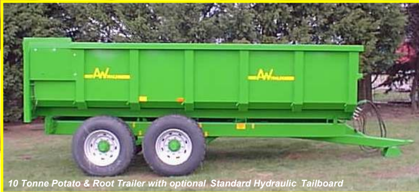
10 Tonne Potato & Root Trailer with optional Standard Hydraulic Tailboard