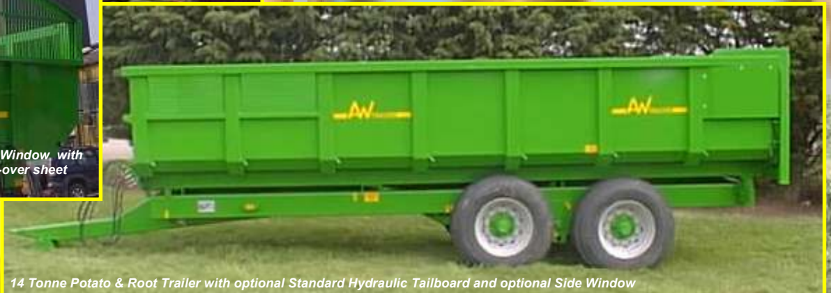
14 Tonne Potato & Root Trailer with optional Standard Hydraulic Tailboard and optional Side Window

The AW Potato & Root Trailers have a long, low, tapered body with a 5mm thick floor and 3mm thick sides supported by wide side channels. They have a strong wide parallel chassis built from RHS and are fitted with high specification running gear. They can be fitted with either sprung or bogie suspension. There are 10 Tonne, 12 Tonne and 14 Tonne models available and 12 Tonne, 14 Tonne and 16 Tonne Potato & Root Trailers are available in our high spec Ultima range.