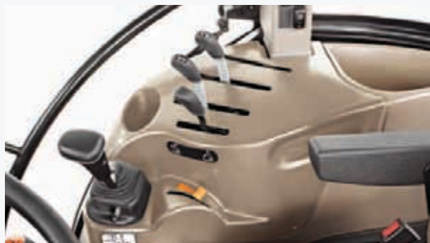
Up to three mechanical rear remote valves are available for the Farmall A range.

Mechanical fast raise/lower allows for easier and more ergonomic hitch operations with the possibility to make adjustments at any time. Pushed forward the fast raise/lower lever lowers implements to set height / depth and pulled back this lever raises implements to the value set by the height limiter.