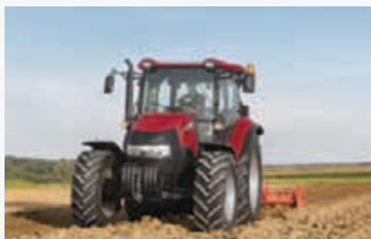
Efficient fieldwork with maximum traction.

With the addition of a Case IH LRZ loader Farmall A tractors are equipped for every loading and handling task around the farm. Loaders are easy to attach or remove and in cab controls are ideally positioned for comfortable operation.