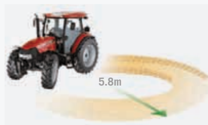
Minimum turning radius of 5.8m.