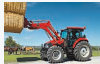
Loaders are easy to attach or remove.